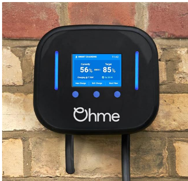
Figure 1 – Ohme Home Pro installed

They are fixed charging units primarily complying with product standard BS EN IEC 61851-1:2019 Electric vehicle conductive charging system, General requirements.