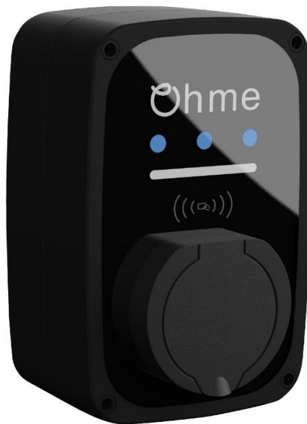
Figure 2 – Ohme ePod

They are fixed charging units primarily complying with product standard BS EN IEC 61851-1:2019 Electric vehicle conductive charging system, General requirements.